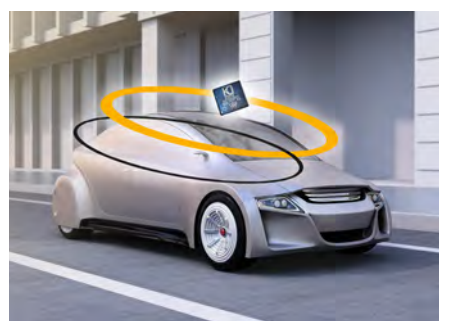
Autonomous driving safety redundancy