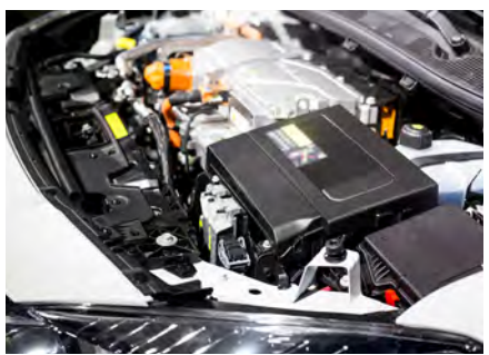
Electric Vehicles: Galvanic isolation for Battery Management Systems